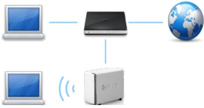
Figure 1) Wireless Hotspot.

Provides the WiFi ability to your network.